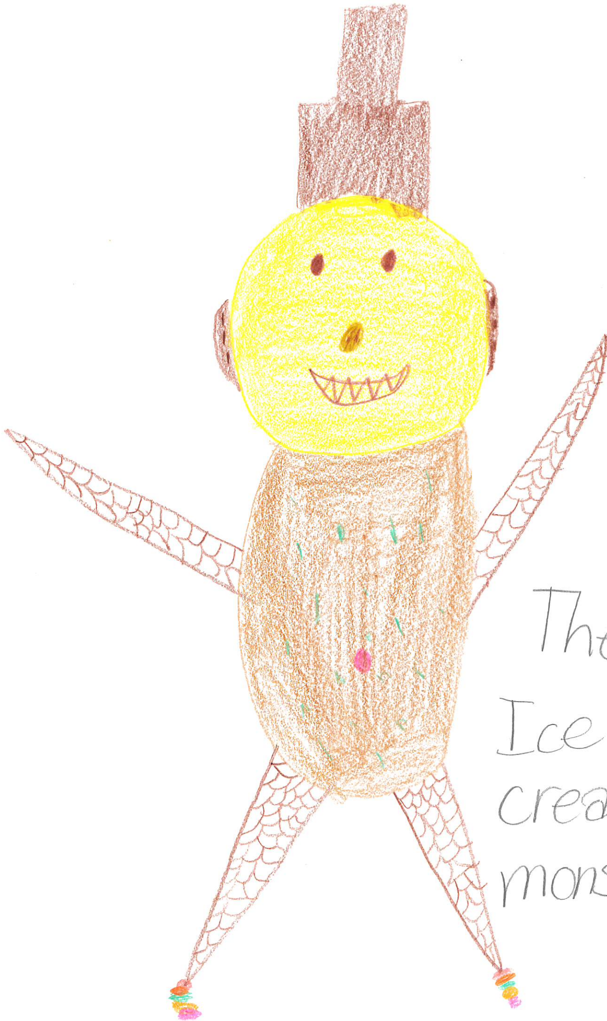
The Ice cream monster